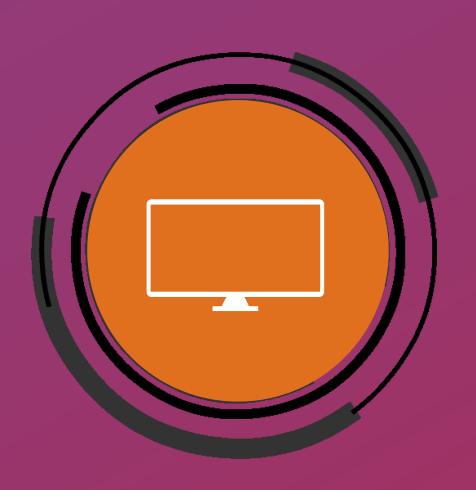
COMPARE PRICES & PRODUCTS