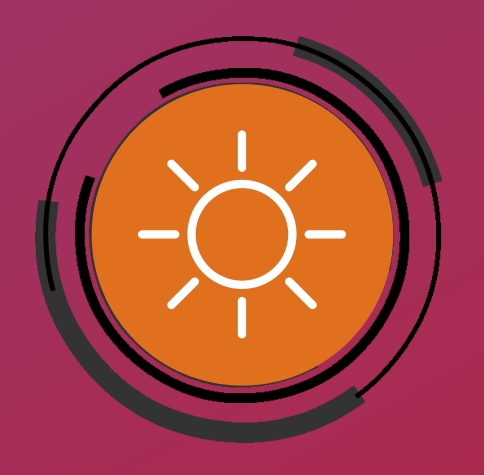
SUPPORT LOCAL PRODUCTS